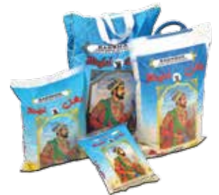
BADSHAH SUPER KERNEL BASMATI RICE