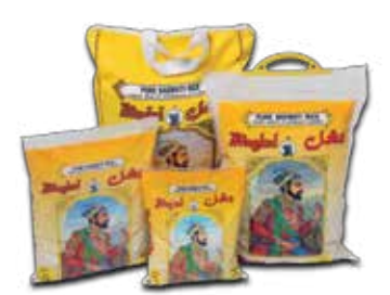
PURE BASMATI RICE